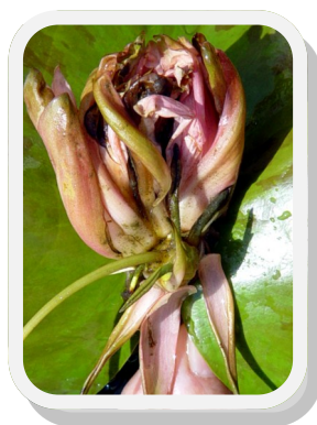
New tropical waterlily viviparous plantlet emerging from spent bloom.

<u>Submerged and Free-Floating Plants</u> (such as Parrot's Feather or Water Lettuce). Pull surplus stems from water by hand or rake. Free floating plants often put off attached baby plants which can simply be snapped off and moved elsewhere. Excess cuttings or plants can always be directed to the compost pile!