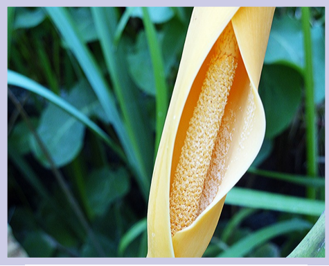
Spath—Bloom of the Elephant Ear

The Tucson Watergardeners 7033 E Paseo San Andres Tucson, AZ 85710