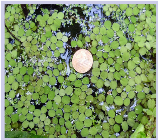
Common salvinia ( Salvinia minima ) Family: Salviniaceae (Water Fern Family)

Salvinia is a rootless, aquatic fern and a perennial. Emergent groups of leaves (fronds), oblong and flat or semi-cupped, grow in chains and float on the water surface forming dense mats. The entire plant is only about 1 inch in depth, and, as ferns, they have no flower. Common salvinia can reproduce by spores or by fragmentation and is an aggressive invader species. If colonies of common salvinia cover the surface of the water, then oxygen depletion can occur. Common salvinia is considered a non-native species (from South America) and on the invasive plant lists in several states—but, not Arizona.