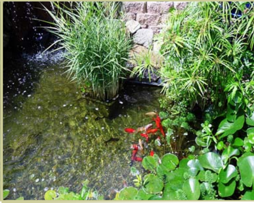
H. HUGE IDEAS /SMALL SPACES

11260 East Prince Road The Minami-Stolley Watergarden Saturday & Sunday