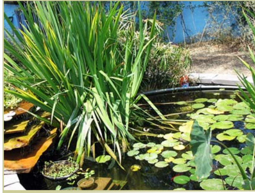
E. THE ARTFUL GARDEN

649 N. Jerrie Avenue The Baker-Fearing Watergarden