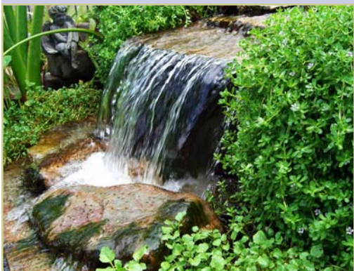
A. NORTHWEST SERENITY