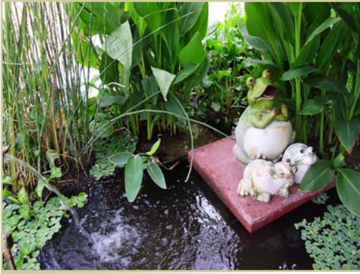
G. FUN OF RE-PURPOSING