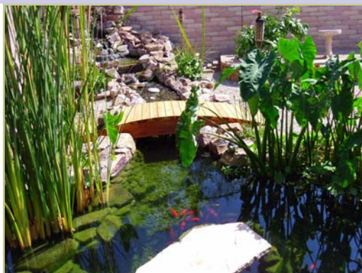
B. PLANTS AS FOCAL POINTS

N. Paseo Penuela 12296 is on the right hand side