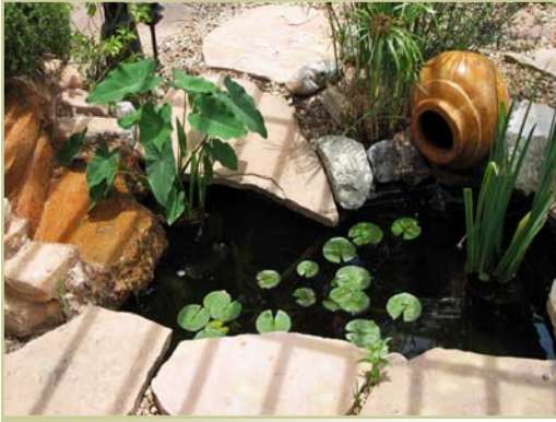
D. THE IN TOWN OASIS

240 N. Sierra Vista Drive The Wisdom Watergarden