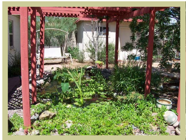
POND A. Dan Jenks & Paul Mosman 4066 E. Camino de Palmas, Tucson 85711 (Major Crossroads: S. Alvernon Way & E. 22nd Street)

This stop has five water features, and has been on past public tours. In fact, Dan freely confesses that he is a bit of a pond addict! The largest 2000 gallon, vinyl lined pond was built in 2008, when backyard space became available because of a dying cottonwood tree. The pond includes a waterfall and a reservoir directly in the waterfall for marginal plants. There is also a skimmer and a biofilter. A Laguna 4100 GPH pump supports this pond. With all these water features, Dan is able to split and enjoy a wide variety of plants in each setting. Connecting the various ponds and sitting areas are concrete pathways that have been hand-formed and hand-tinted. “They [the ponds] are the life of my yard, and they bring so much joy and pleasure to me everyday” reiterates Dan.