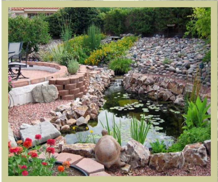
POND C. Robin Baker & Bruce Matlock, 1801 W. Rudasill Road, Tucson 85704 ( Major Crossroads: North La Canada Drive & West Orange Grove Road )

With inspiration from our 2010 pond tour and a Bobcat tractor, this pond was created in January 2011. While Robin and Bruce had a small, pre-formed pond, they just knew bigger was better! This 3500 gallon pond, with a depth of 3 feet in the center, is supported by a Hayward pump system that includes a sand filter—with a similar set up to a swimming pool system. There is a waterfall and two stationary frogs that help aerate the water. This habitat is home to a variety of aquatic life, including koi, Shubunkin goldfish, and red-eared slider turtles, as well as mosquito fish. There are numerous aquatic marginal plants. Oh yes, they still have the smaller pre-formed pond which is home to an Oscar fish. “This is our peaceful, serene tropical oasis” offers Robin, “and our dream in progress!” The ideas for enhancements keep coming!