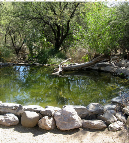
Spur Cross Ranch Conservation Area Maricopa County