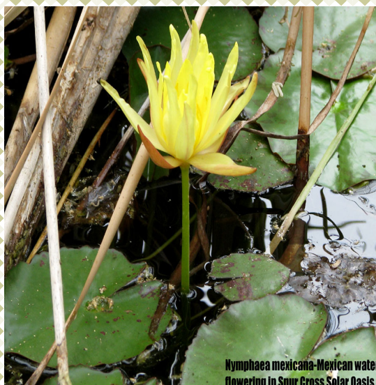
Nymphaea mexicana-Mexican water lily flowering in Spur Cross Solar Oasis