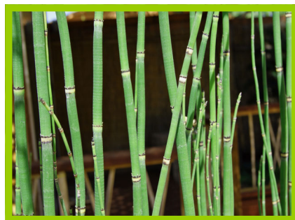
Horsetail Rush ( Equisetum hyemale ) Family: Equisetaceae

Sell or Trade Water Garden Items. Ad space is free to members! Write-ups on your water garden items must be in to the editor by the 4th of each month.